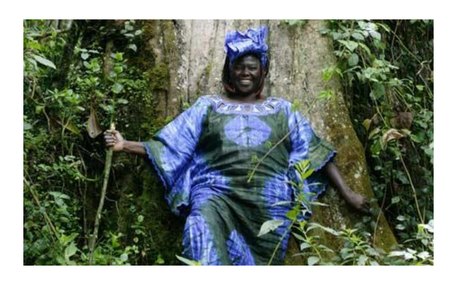
Wangari Maathai's life, work, courage and testimony, has vast meaning for the teaching and practice of public health nutrition, in Africa and worldwide