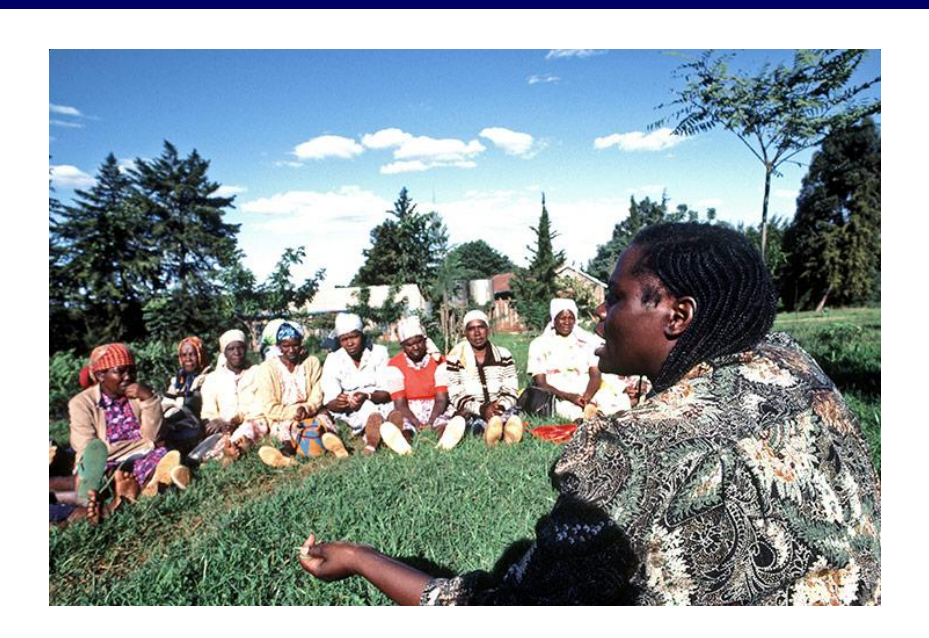
Encouraging and empowering women of Kenya to sustain their livelihoods, outside the headquarters of the Green Belt Movement in Nairobi, in 2004.